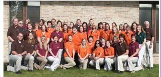
Our Current Staff