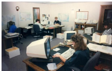
The Billing Room in 1990

With 30 years of experience under our belt, we currently have 50 employees in our office, 689 customers for whom we perform at least one service, and have recently reached a billion dollar invoicing milestone—in the past 12 months we have submitted 324,363 invoices for a total dollar amount of $1,135,413,308.14!