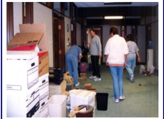
Moving Day! March 2004