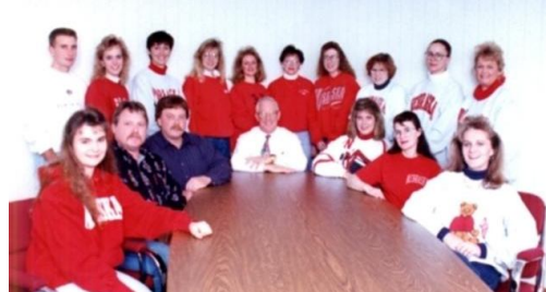
Our Staff in 1994